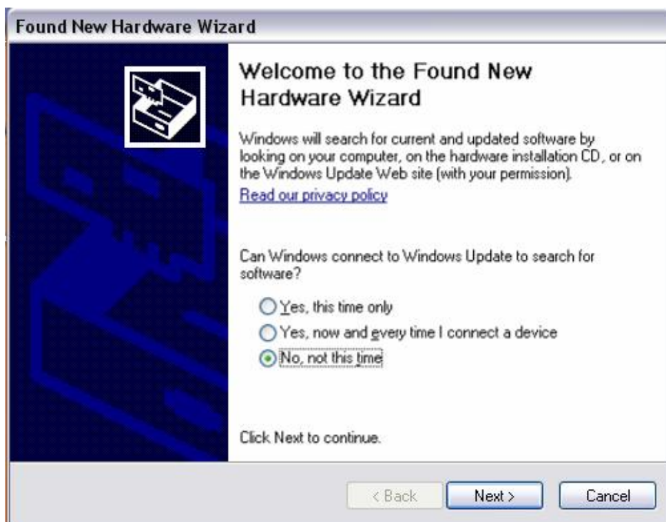
Picture 10 Guided installation of new hardware USB Serial Port.

The guided installation of new hardware shall be made, as per Picture 10. This window may appear or not, depending on system’s settings.