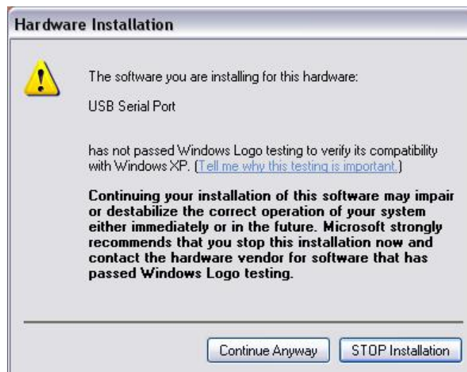
Picture 16 Windows Logo's warning message.

If the warning window for compatibility with Windows XP appears, due to Windows Logo's testing, as per Picture 16, press "Continue Anyway".