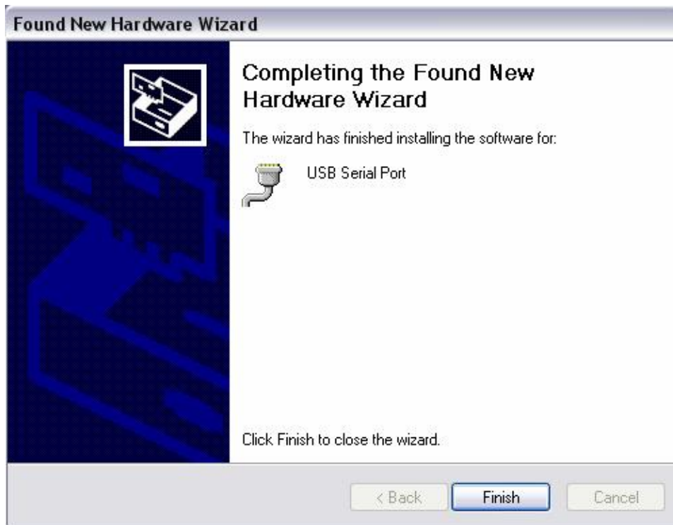
Picture 17 Completion of the USB Serial Port's installation.

Select "Finish" to complete the installation of drivers USB Serial Port. The system informs the user that USB drivers have been installed correctly through a message as per Picture 18.