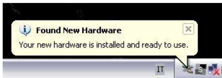
Picture 18 End of installation of USB drivers.

Select "Finish" to complete the installation of drivers USB Serial Port. The system informs the user that USB drivers have been installed correctly through a message as per Picture 18.