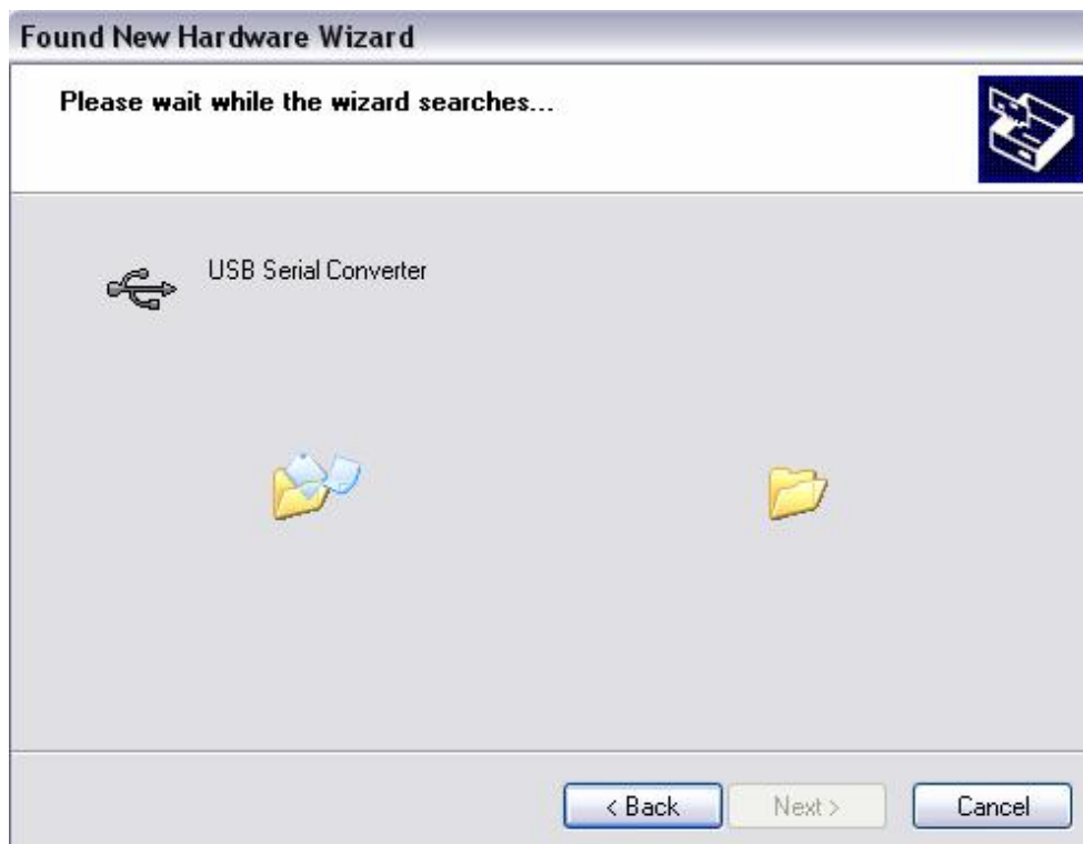
Picture 6 Installation of USB Serial Converter software in progress.

The system will start installing the drivers USB Serial Converter, as shown in Picture 6.