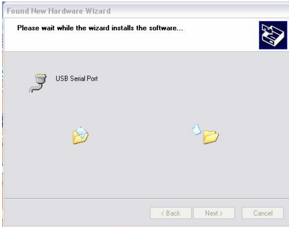
Picture 15 Installation of USB Serial Port software in progress.

If the warning window for compatibility with Windows XP appears, due to Windows Logo's testing, as per Picture 16, press "Continue Anyway".