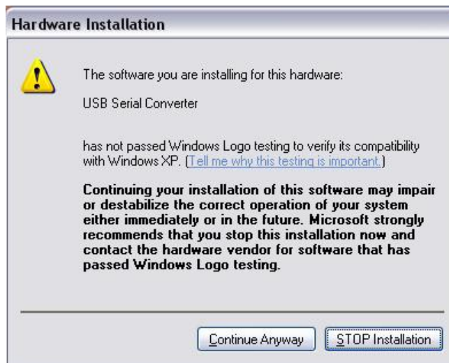
Picture 7 Windows Logo's warning message.

If the warning window for compatibility with Windows XP appears, due to the Windows Logo's testing, as per Picture 7, press "Continue Anyway".