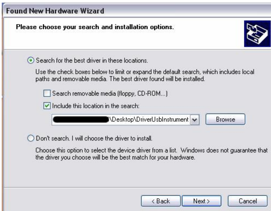
Picture 4 Choice of options for driver search and installation.

Select the option “Install from a list or specific location (Advanced)” and press “Next”. The window in Picture 4 will appear. Select “Search for the best driver in these locations”, and activate the option “Include this location in the search”.