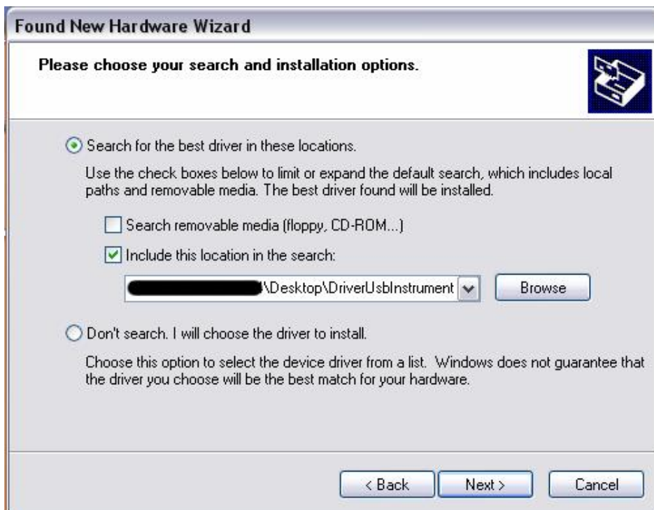
Picture 4 Choice of options for driver search and installation.

Select the option “Install from a list or specific location (Advanced)” and press “Next”. The window in Picture 4 will appear. Select “Search for the best driver in these locations”, and activate the option “Include this location in the search”.