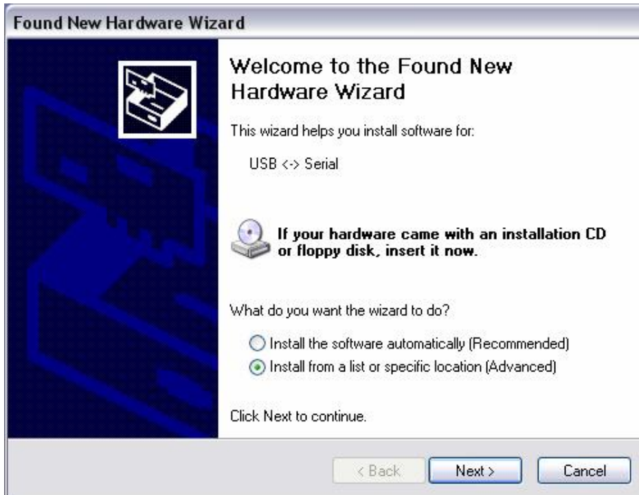
Picture 3 Selection of way of installing drivers USB Serial Converter.

Select the option “Install from a list or specific location (Advanced)” and press “Next”. The window in Picture 4 will appear. Select “Search for the best driver in these locations”, and activate the option “Include this location in the search”.