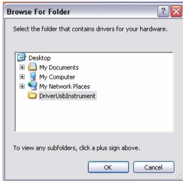
Picture 13 Selection of USB driver folder.

Through the “Browse” key you can select the folder where USB drivers are saved. According to the given example, a window like Picture 13 appears.