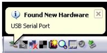
Picture 9 Acknowledgment of new hardware USB Serial Port.

Select “Finish” to complete the installation of drivers USB Serial Converter. The system acknowledges the new hardware USB Serial Port, informing the user through a message as per Picture 9.