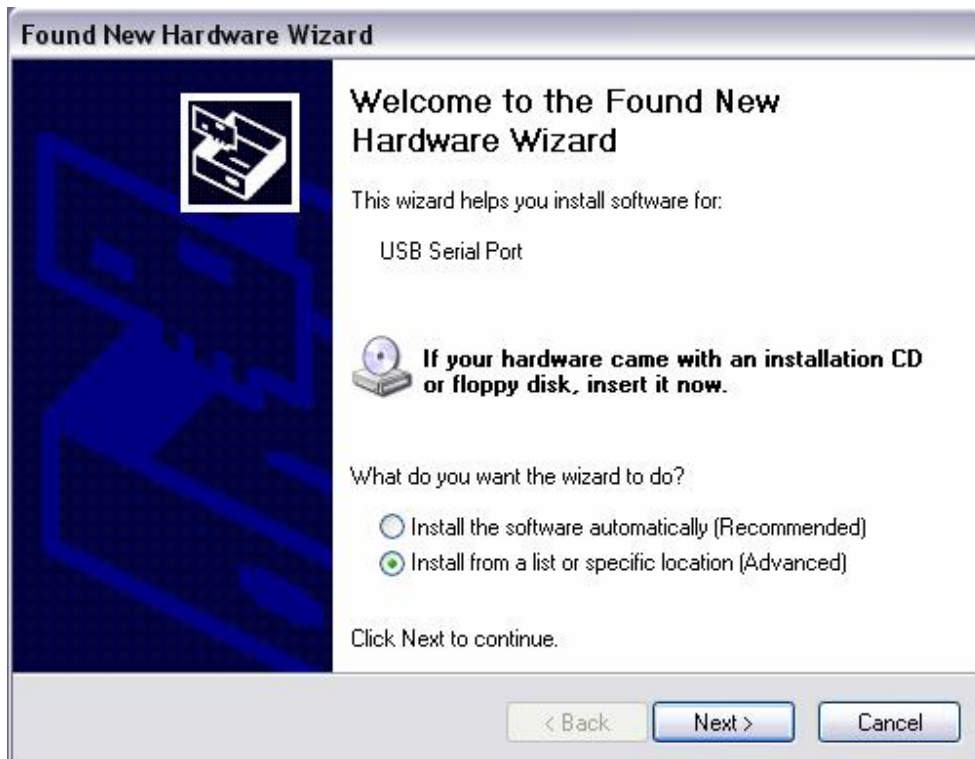
Picture 11 Selection of way of installing drivers USB Serial Port

Select the option “Install from a list or specific location (Advanced)” and press “Next”. The window in Picture 12 will appear. Select “Search for the best driver in these locations”, and activate the option “Include this location in the search”.