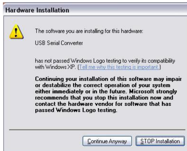
Picture 7 Windows Logo's warning message.

If the warning window for compatibility with Windows XP appears, due to the Windows Logo's testing, as per Picture 7, press "Continue Anyway".