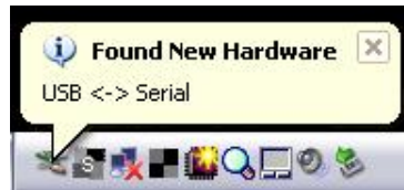
Picture 1 Acknowledgment of new hardware USB Serial Converter.

Connect the equipment to the PC through the USB cable. After a while, the small window in Picture 1 will appear, informing the user that a connection with a new USB Serial Converter device has been found.