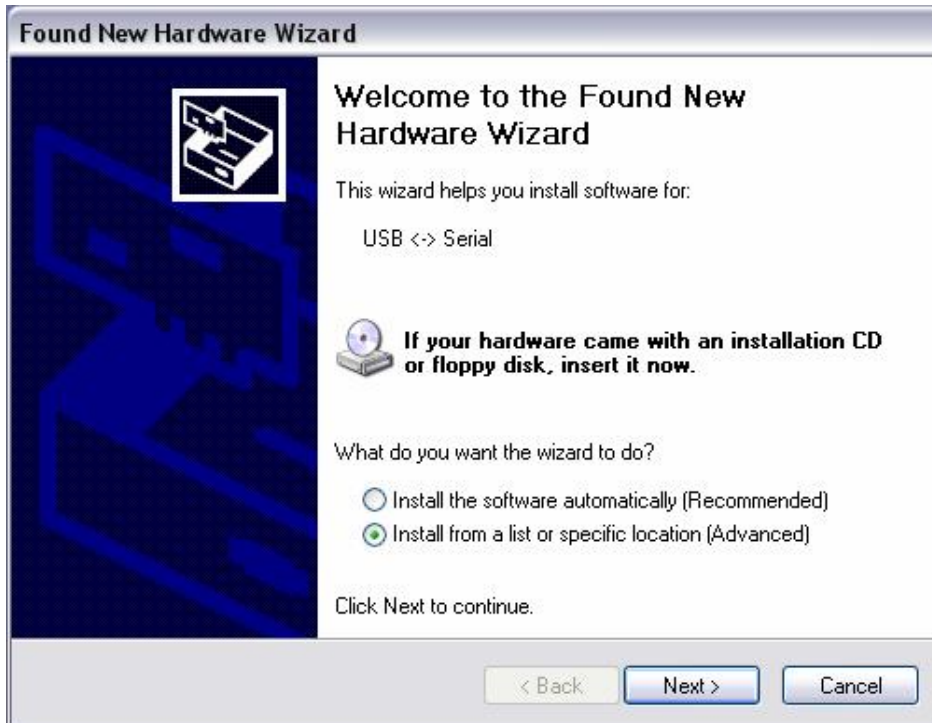
Picture 3 Selection of way of installing drivers USB Serial Converter.

Select the option “Install from a list or specific location (Advanced)” and press “Next”. The window in Picture 4 will appear. Select “Search for the best driver in these locations”, and activate the option “Include this location in the search”.