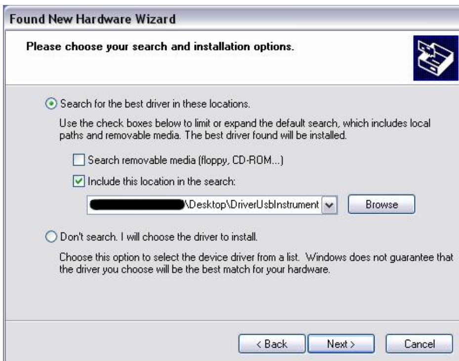
Picture 14 Setting of USB driver folder.

Select the folder containing the USB drivers and press “OK”. Then press the “Next” key of the window in Picture 14.