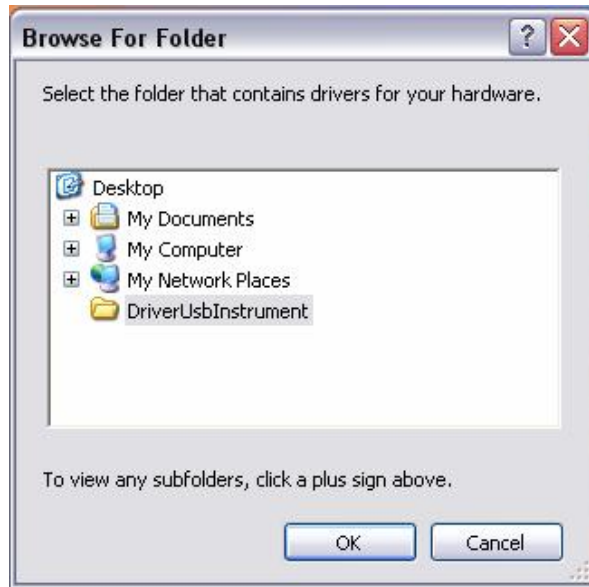
Picture 13 Selection of USB driver folder.

Through the “Browse” key you can select the folder where USB drivers are saved. According to the given example, a window like Picture 13 appears.