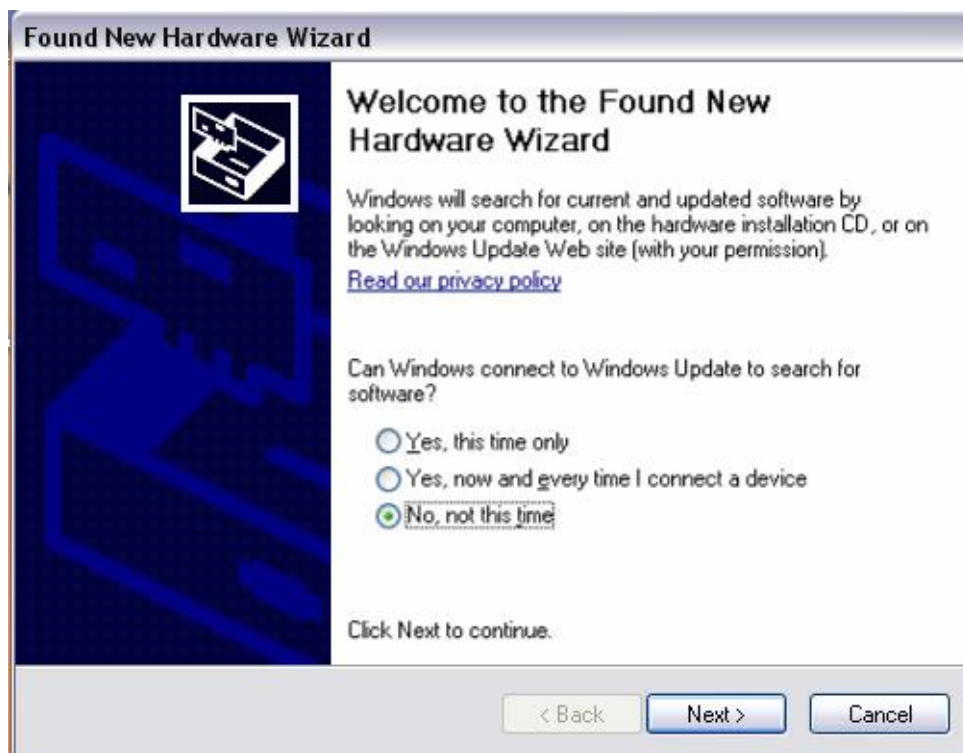
Picture 2 Guided installation of new hardware USB Serial Converter.

Afterwards, the window in Picture 2 appears, for guided installation of the new hardware. This window may appear or not, depending on system's settings.