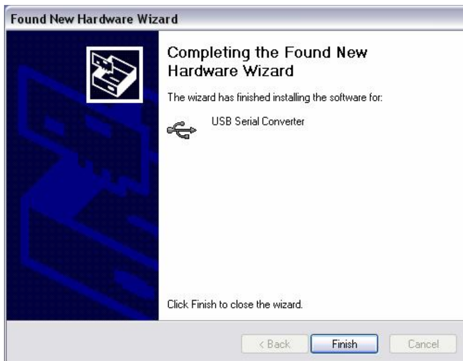
Picture 8 Completion of the USB Serial Converter's installation.

The installation procedure goes on and, once it has finished, the window in Picture 8 (completion of the new hardware installation) appears.