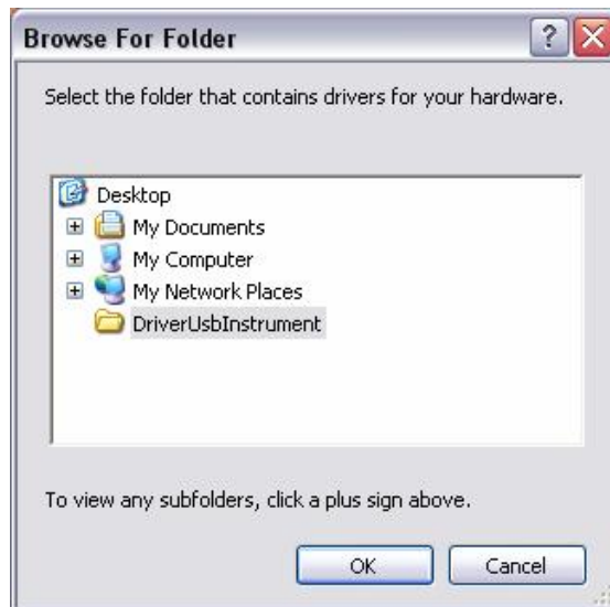
Picture 5 Selection of USB driver folder.

Select the folder containing the USB drivers and press “OK”. Then press the “Next” key of the window in Picture 4.