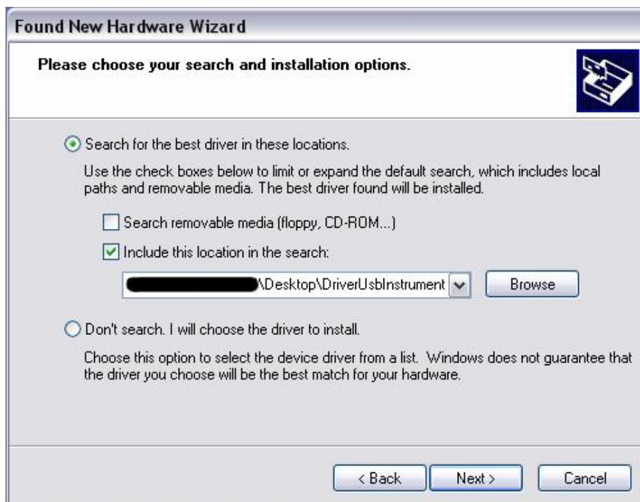
Picture 14 Setting of USB driver folder.

Select the folder containing the USB drivers and press “OK”. Then press the “Next” key of the window in Picture 14.