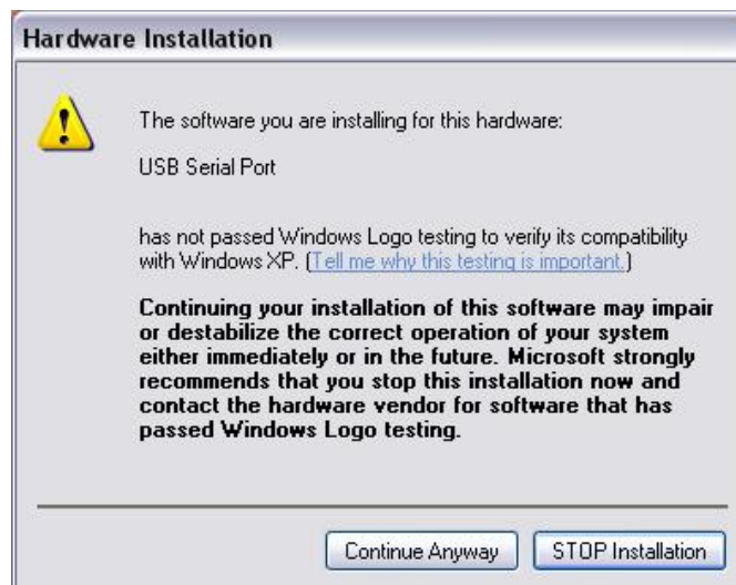
Picture 16 Windows Logo's warning message.

If the warning window for compatibility with Windows XP appears, due to Windows Logo's testing, as per Picture 16, press "Continue Anyway".